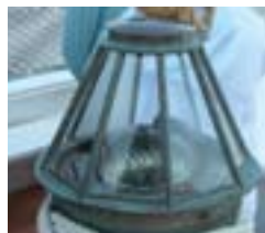
Ship's compass on the Schooner Lannon