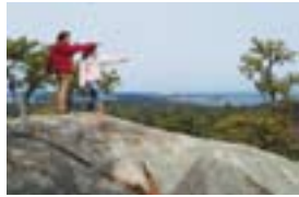
The view from Red Rock