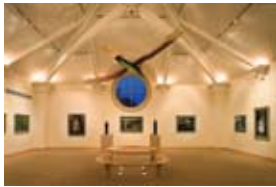
above, The Museum's newest gallery hosts 20th & 21st century works

to the history of maritime trade and fishing feature tools, equipment, models, a fishing dory, and two small vessels which made