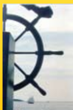
The bronze Man at the Wheel statue was created by sculptor Leonard Craske in 1923

You can purchase an authentic sou'wester hat in many of the downtown shops. It's a Gloucester icon that you'll appreciate in foul weather!